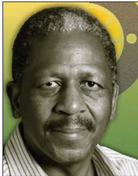
ANC TREASURER GENERAL MATHEWS PHOSA

As we approach another milestone in our democracy, we can justifiably be proud of everything we have achieved together. We have done much to change our country for the better.