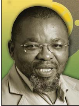
ANC SECRETARY GENERAL GWEDE MANTASHE

Local development is about partnership. This election will be about building thousands of partnerships, in every village, town and city in South Africa. We invite all members of the PBF to join these partnerships and to change our communities for the better.