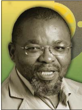
ANC SECRETARY GENERAL GWEDE MANTASHE

Local development is about partnership. This election will be about building thousands of partnerships, in every village, town and city in South Africa. We invite all members of the PBF to join these partnerships and to change our communities for the better.